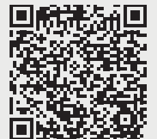
More information about RSB coverage

Viewpoints is a publication from UBC Human Resources and provides consumer benefits and health information to UBC retirees on a semi-annual basis.